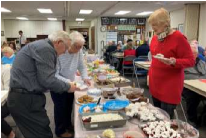
A potluck lunch with 80 fellow members was enjoyed following the annual meeting.